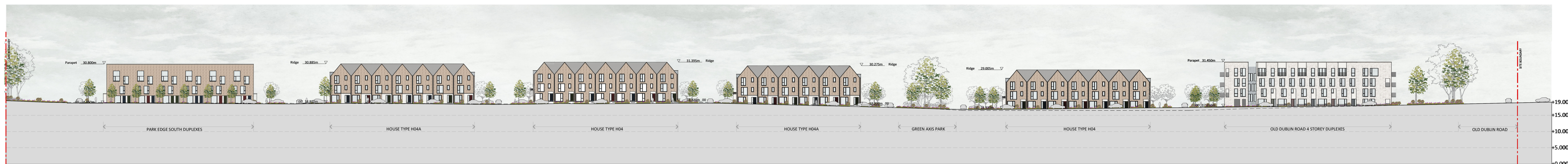
SECTION B-B 1:500