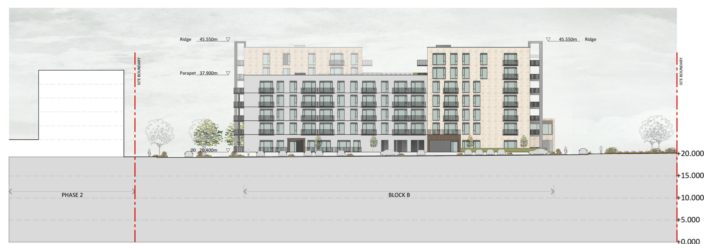
SECTION G-G 1:500