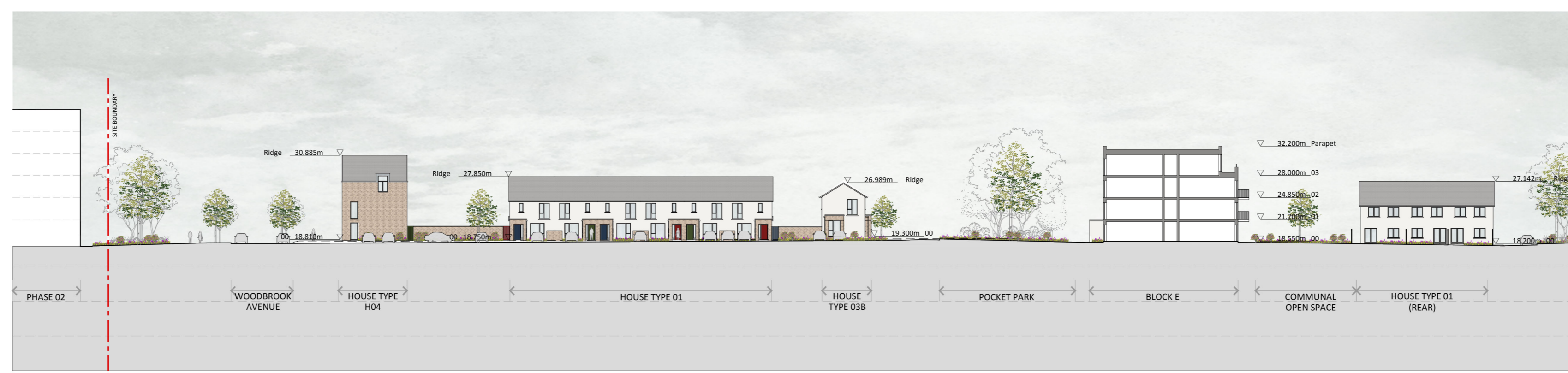
SECTION E-E 1:500