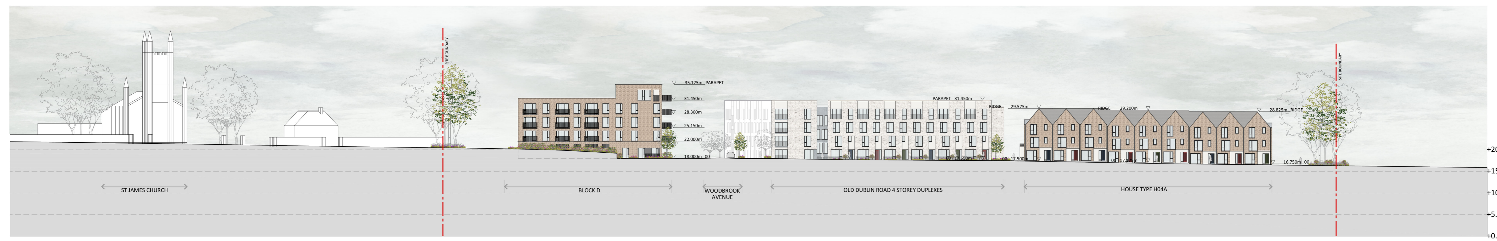
SECTION A-A 1:500