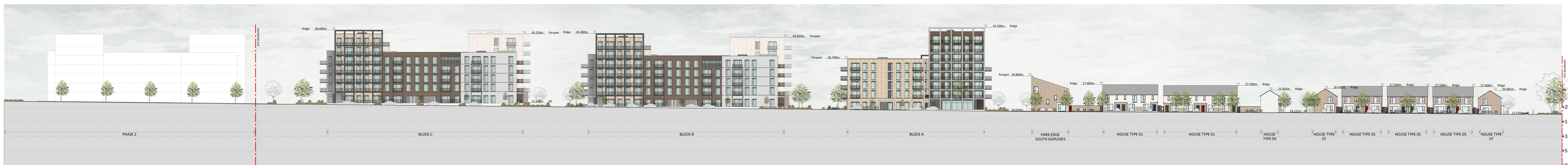
SECTION F-F 1:500