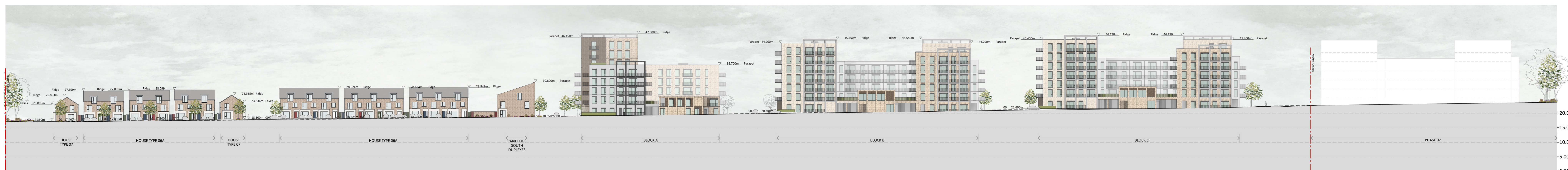
SECTION C-C 1:500