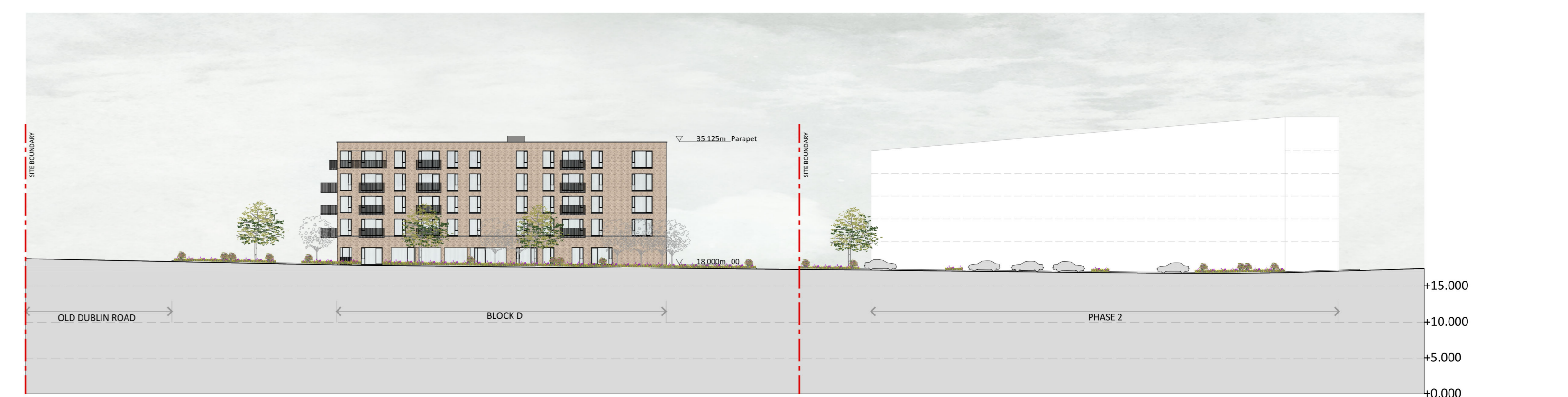
SECTION H-H 1:500